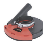
7" Dust Shroud